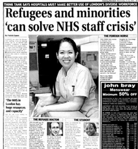
The London Evening Standard ran the above report on the King's Fund report published in July 2003 and backed it with a sympathetic editorial.

Doctors preparing for Professional Linguistic Assessment Board (PLAB) and International English Language Testing System (IELTS) have received support through the Personal Study Accounts. They have also been used to fund applications for membership of the Royal Colleges, which are seen as improving chances of employment. Nurses preparing for IELTS, registration and participating in the Praxis-led pre-adaptation courses have received money, as have students undertaking degree and other professional studies in professions allied to medicine, such as pharmacy.