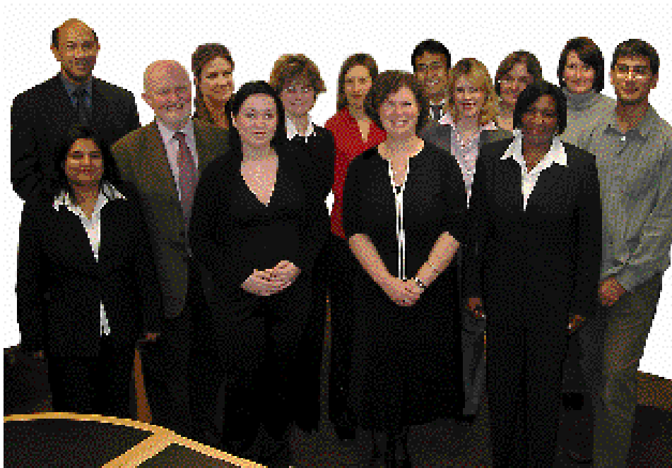
Staff of City Parochial Foundation and Trust for London.